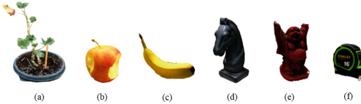
Fig. 3. Reconstructed 3D meshes of objects for natural objects such as (a) a potted plant, (b) a bitten apple, and (c) a banana, and man-made objects such as (d) a horsehead, (e) a Buddha statue, and (f) a tape measure scanned using our 3D scanner.

sequence of small rotations. After each rotation we capture and store an image to the Raspberry Pi before making the next rotation. We continue this process until the camera makes a complete revolution around the object, after which the motor returns to its starting point. We send a signal from the Raspberry Pi to the host computer indicating termination of the Python script. We then automatically transfer each image from the Raspberry Pi to the scanner control computer. We manually import the image set into Autodesk ReMake and generate a textured 3D mesh of the object [1]. In Fig. 3, we show the results of automatically capturing dense images of a variety of natural and man-made objects using our 3D scanner and reconstructing them using Autodesk ReMake.